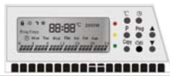
ELEX ET7 Convective panel heater with electronic thermostat and 7 day multi-programmable digital timer