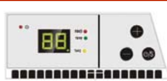
ELEX ET1 Convective panel heater with electronic thermostat and 24 hour digital countdown timer